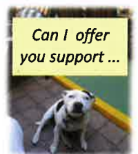
The Adventures of Allee!!!