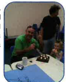
The 3 Wise Men—My 1st 'clean' birthday ★ My 2nd 'clean' birthday

After being released from yet another prison sentence in 2001 and on a long parole, I knew something had to change. Not knowing I had this disease that wanted me dead, or that alcohol was a drug, I successfully drank myself out of a heroin habit, which brought me to my knees in 2010. Over that 9 year period, I managed to get into a relationship, have 2 children, bought a house and learn a great trade. I don't know exactly when I lost all that or why I could never get home or how I would wake up a long way from where I had begun. I have lost partners, kids, jobs and homes before but this time was different, I had totally lost myself.