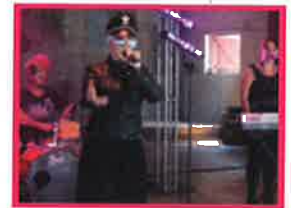
Extremely Pink belting out some tunes...