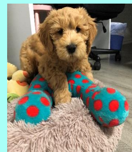
Welcome Home Bear