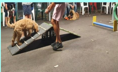
Having a Great time At Puppy School